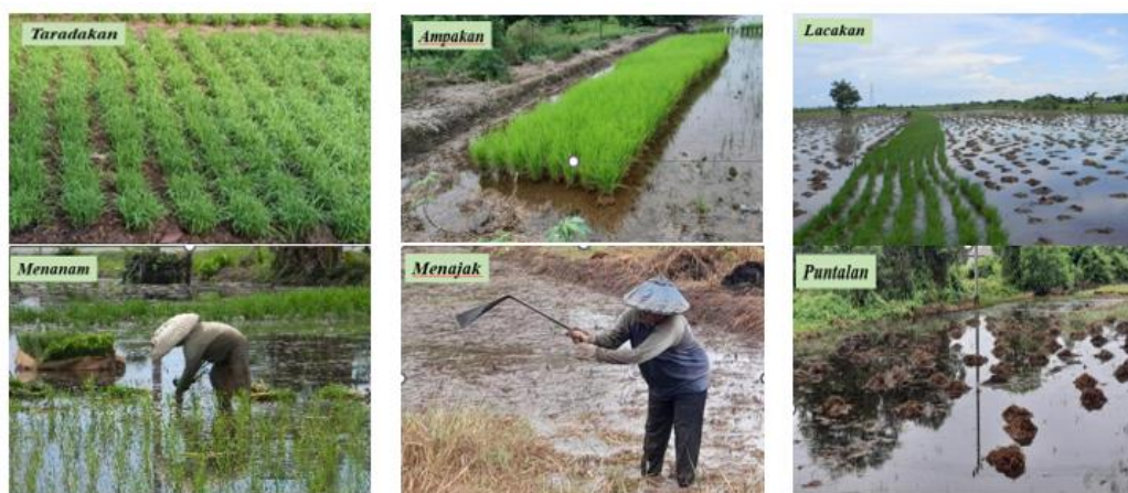
Figure 2. Several stages of land preparation and transplanting of rice in Banjarese-local rice cultivation system. Taradakan : rice seedlings which 30 to 40 d old located on raised beds or slightly elevated plains; ampakan : rice seedlings which aged 31 to 81 d located on the edges part of the rice fields; lacak : rice seedlings which aged 71 to 120 d located in the middle of a rice field; tanam/menanam : planting rice seedlings which aged 126 to 140 d from lacak to the rice field; menajak : doing the land clearing using tajak (cutting tool with long handle that is looks like a golf club); pantalan : lump (ball-shaped) of cuts weeds and bushes.

After seedlings aged 30 to 40 d, seedlings are transplanted ( meampak ) to the edges part of the submerged rice fields, rice seedling at this stage are called ampakan (Figure 2). Each clump of rice is divided into 4 to 5 parts, each of which is planted in the ampakan plot. The meampak activity occurred simultaneously as the soil